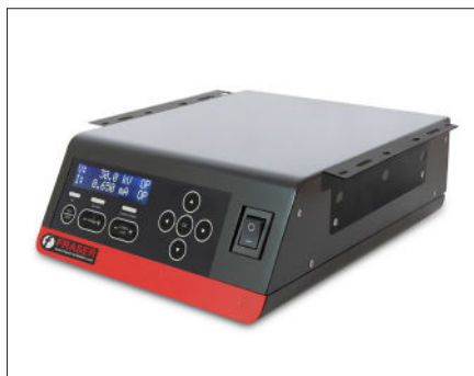
The brackets can be fitted to allow for 'under bench' mounting.