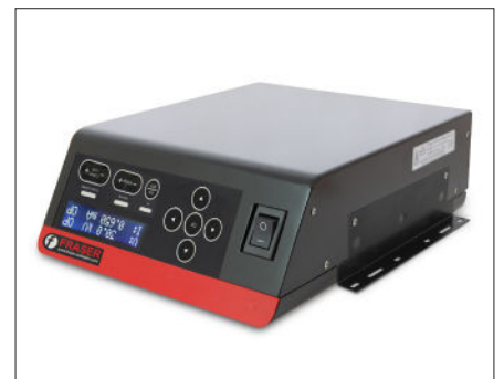
The display and keypad can be rotated by 180° for wall mounting. Please specify 'inverted display' on purchase orders.