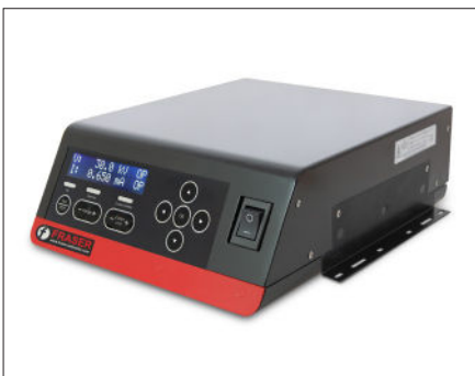
Standard 'bench top' fixing bracket position.

The IONFIX range has been designed for ease of use with brackets for flexible mounting.