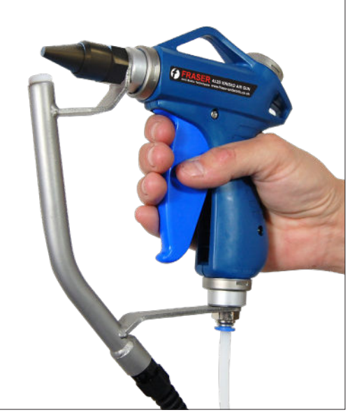
4125-B with bottom air inlet